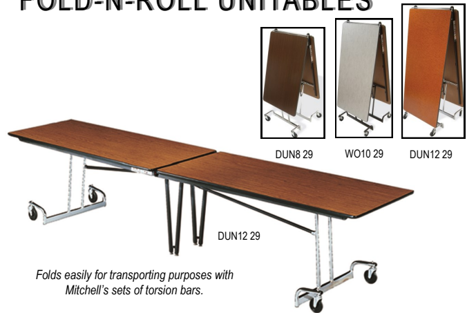
Folds easily for transporting purposes with Mitchell's sets of torsion bars.

Available in 8'-1", 10'-1" & 12'-1" L x 30" W and either 27" or 29" H. Mitchell offers a choice of Nickel Chromium or Black Powder Coated end legs. UniTables have automatic steel locks when the table is in the user position and steel uplocks when transporting.