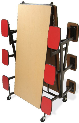
Model # NP12-12 29